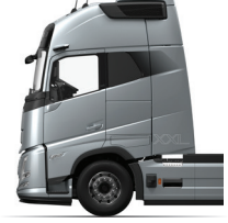
Globetrotter XXL cab