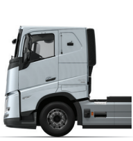
Low sleeper cab