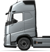
Globetrotter XL cab