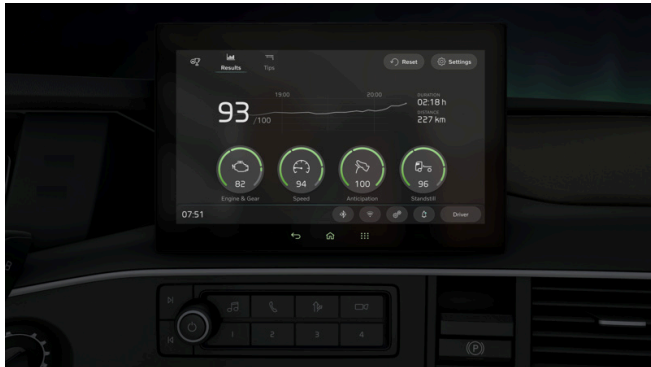
Driver Coaching in the side display.

* Available only for Volvo FH, Volvo FM and Volvo FMX. INFOHIGH is required.