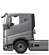
Low sleeper cab