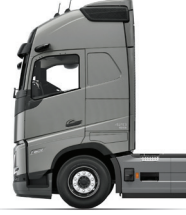
Globetrotter XL cab