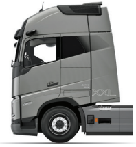
Globetrotter XXL cab