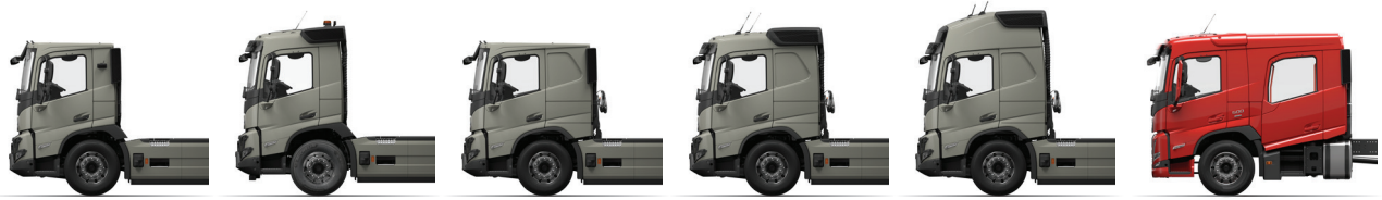
Low day cab